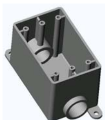
RFDC10, RFDC15, RFDC20 \frac{1}{2} ", \frac{3}{4} ", 1"