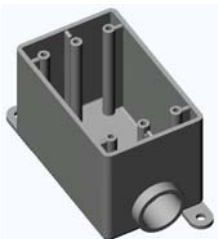
RFDS10, RFDS15, RFDS20 \frac{1}{2} ", \frac{3}{4} ", 1"

Single Gang Deep Boxes are available in various configurations, with sockets to accommodate \frac{1}{2} ", \frac{3}{4} " and 1" PVC rigid conduit.