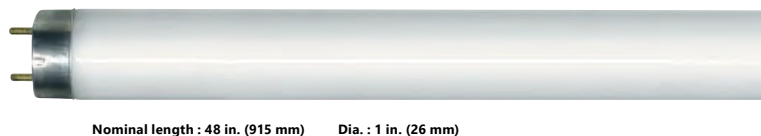
Nominal length : 48 in. (915 mm) Dia. : 1 in. (26 mm)

Order code: 51177 Description: F32T8/BL/RS/G13/STD UPC: 69549011779 Case quantity: 25