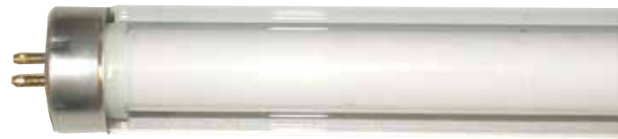
Nominal length : 48 in. (915 mm) Dia. : 1 in. (26 mm)

Order code: 59243 Description: F54T5/41K/8/HO/PS/G5/COLDSTART/STD UPC: 69549592438 Case quantity: 25