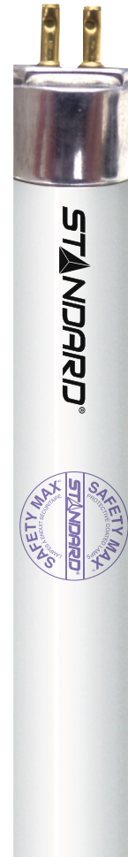
Nominal length : 46 in. (1 168 mm) Dia. : 5/8 in. (16 mm)

Shape: T5 Base: G5 (Min Bipin) Starting method: Program Start (PS) Wattage (W): 54 Colour temperature (K): 5 000 CRI: 85 Rated life on PS/PRS 1 ballast: Based on a 3 hour start 30 000 Based on a 12 hour start 40 000 Initial lumens (lm): 4 900 Mean lumens (lm): 4 465 Nominal efficiency (lm/W): 89 TCLP compliant: Yes Phosphor composition: Triphosphor Protective coating: PTFE 2 Nominal lamp operating frequency (Hz): 60 3 Minimum starting temperature (°C): -10