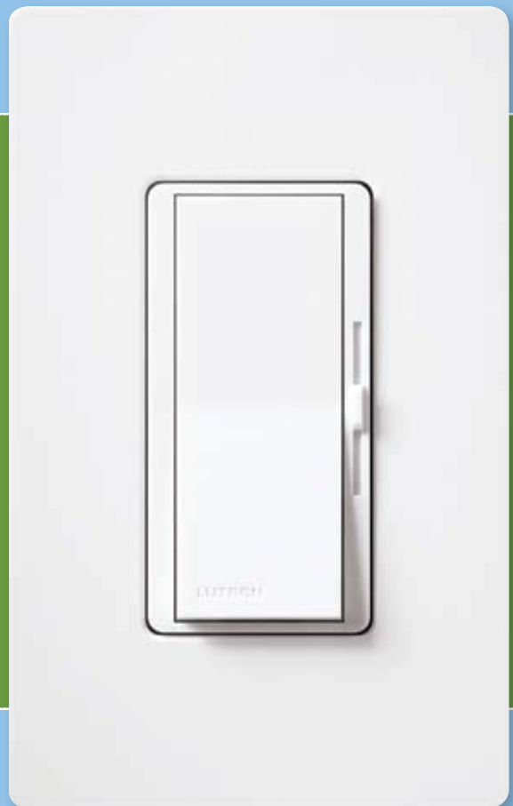
Diva ® eco-dim dimmer (actual size)

Great for dining rooms, bedrooms, bathrooms, and kitchens.