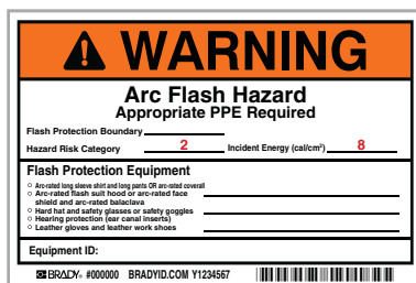
4" x 6" Arc flash hazard