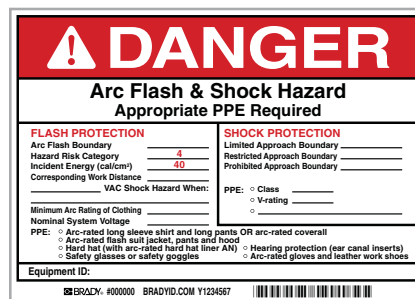
5" x 7" Arc flash & shock hazard