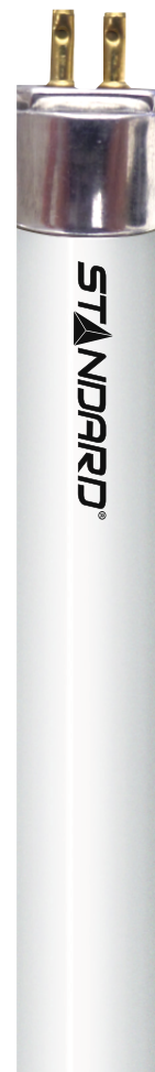
Nominal length : 22 in (559 mm) Dia. : 5/8 in. (16 mm)

1 The life rating indicated is based on 3 hour burning cycles under specified conditions and with ballast meeting ANSI specifications. 2 The minimum starting temperature is a function of the ballast.