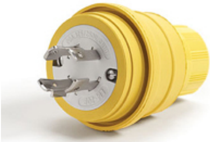
Series image - Reference only