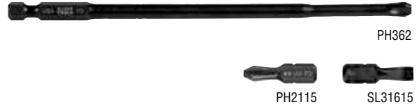
Klein Lasts Longer Before Cam Out